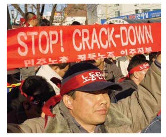
Migrant Workers' Demonstration in Korea

events: Korean movement is used-to, to apply music in order to inspire their activists. Realising the tradition, migrant workers created a popular musical band known as Stop Crackdown . It as an example in this regard, which was created with singers & composers of 5 people -including Nepali, Burmese, Cambodian migrant workers along with Korean themselves. Stop Crackdown remained influential till deportation of Nepali vocalist of this band.