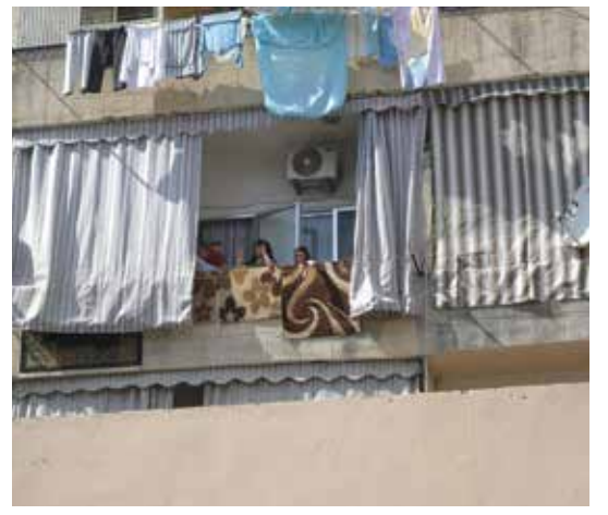
Domestic worker place of Lebanon