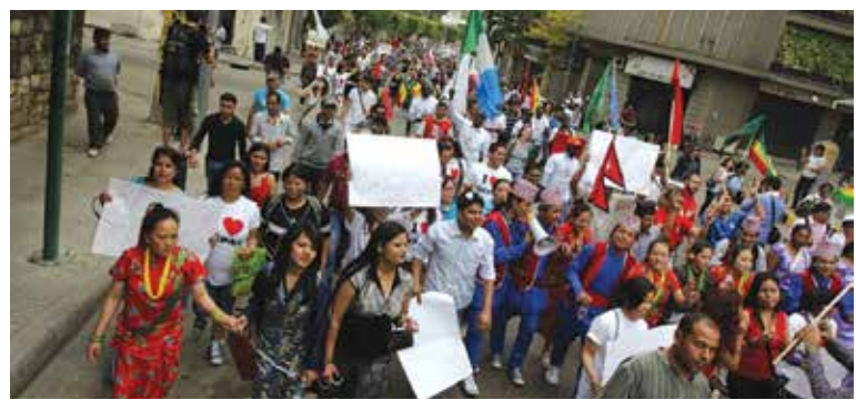
Migrant workers' demonstration in Lebanon