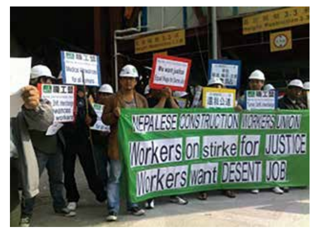
Migrant workers' demonstration in Hongkong