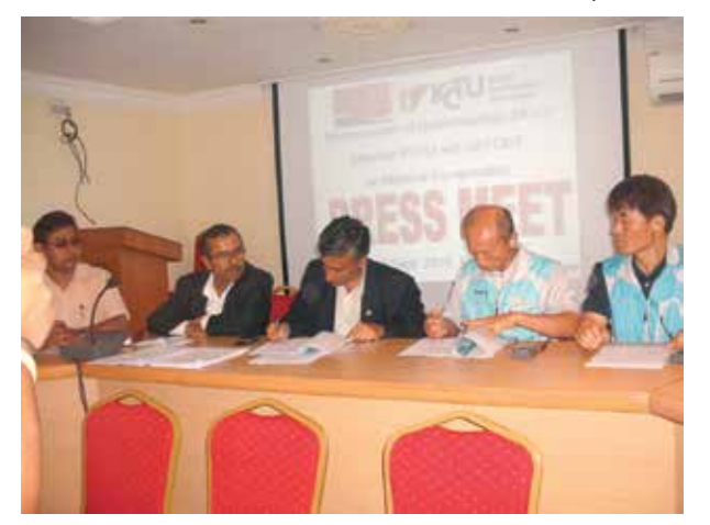
Memorandom of Understanding (MOU) between KCTU and GEFONT on Bilateral Co-operation