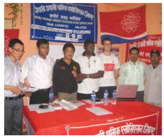
GEFONT Support Group (GSG) in Malaysia

There were no charity organisations as in Korea. Among the few NGOs working with migrant workers, there was unnecessary rivalry. As a part of the standing order of GEFONT movement, we tried to form GSG in Malaysia. Having strict in rule it was difficult to form any types of union structure there. However, some sorts of association