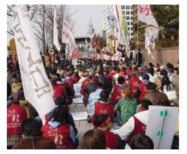
Migrant Workers' Demonstration in Korea

This way GEFONT triggered a long fight beyond border; honestly there was no specific strategy,